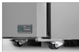
Low Profile (LP) 1½" Castors Upcharge applies for (LP) size castors