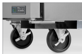
Standard 5" Castors