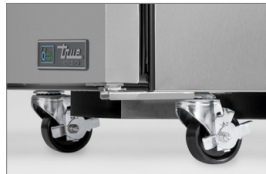
ADA 3" Castors