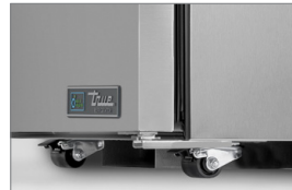
Low Profile (LP) 1½" Castors Upcharge applies for (LP) size castors