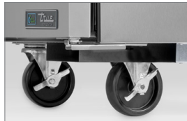
Standard 5" Castors