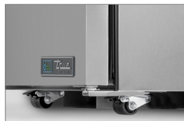
Low Profile (LP) 1½" Castors Upcharge applies for (LP) size castors