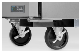
Standard 5" Castors