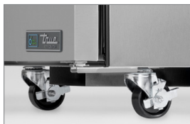
ADA 3" Castors