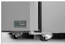
Low Profile (LP) 1½" Castors Upcharge applies for (LP) size castors