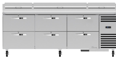
Straight-On Front View