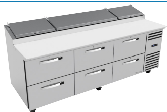
Front Left View