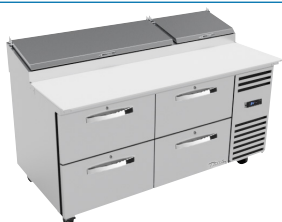
Front Left View