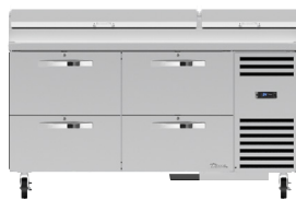
Straight-On Front View