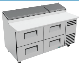
Front Left View