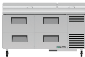
Straight-On Front View