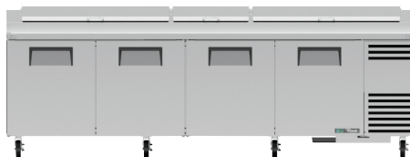
Straight-On Front View