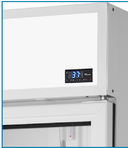
Standard: Display in sign frame.

Swing Door Scientific Refrigerator with Hydrocarbon Refrigerant~True Standard Look Version 01