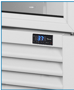
Optional: Display in Grill. Must be indicated at time of order.