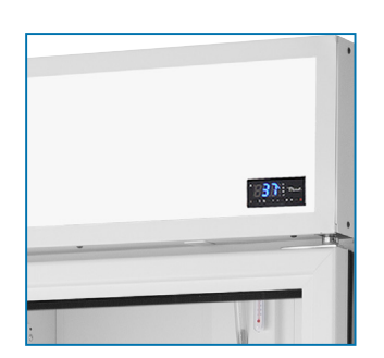
Standard: Display in sign frame.

Swing Door Scientific Refrigerator with Hydrocarbon Refrigerant~True Standard Look Version 01