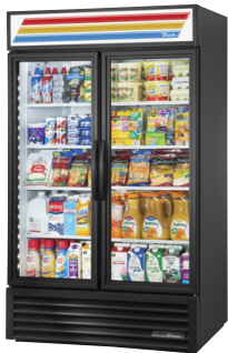
Standard Black Exterior