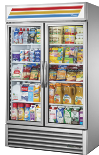
Optional Stainless Exterior