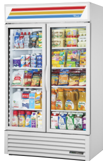
Optional White Exterior