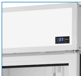
Standard: Display in sign frame.

Swing Door Scientific Refrigerator with Hydrocarbon Refrigerant~True Standard Look Version 01