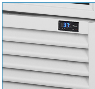
Optional: Display in Grill. Must be indicated at time of order.