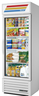
Optional White Exterior