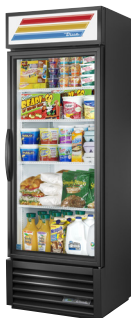
Standard Black Exterior