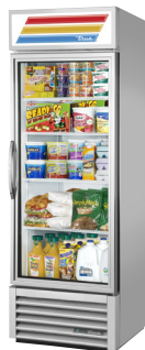
Optional Stainless Exterior