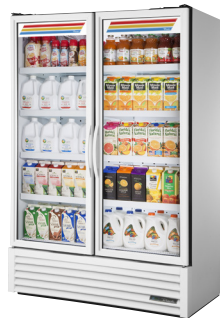
Optional White Exterior