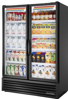
Standard Black Exterior