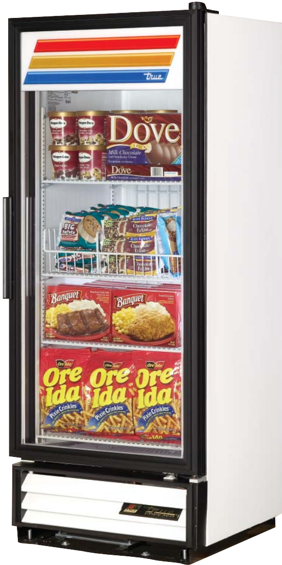
Shown with optional novelty basket.